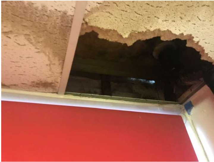
Ceiling in the second classroom area. We can now see directly through to the outside in parts of the classroom. Again, this is recent damage that has happened since the recent re-roofing